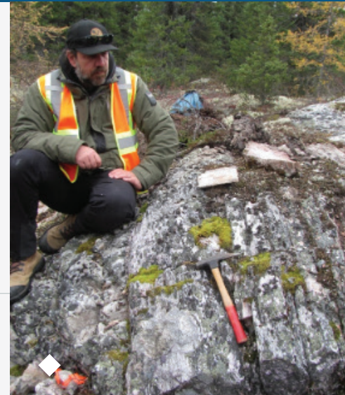
Four-metre long spodumene crystal at Spodumene Mountain